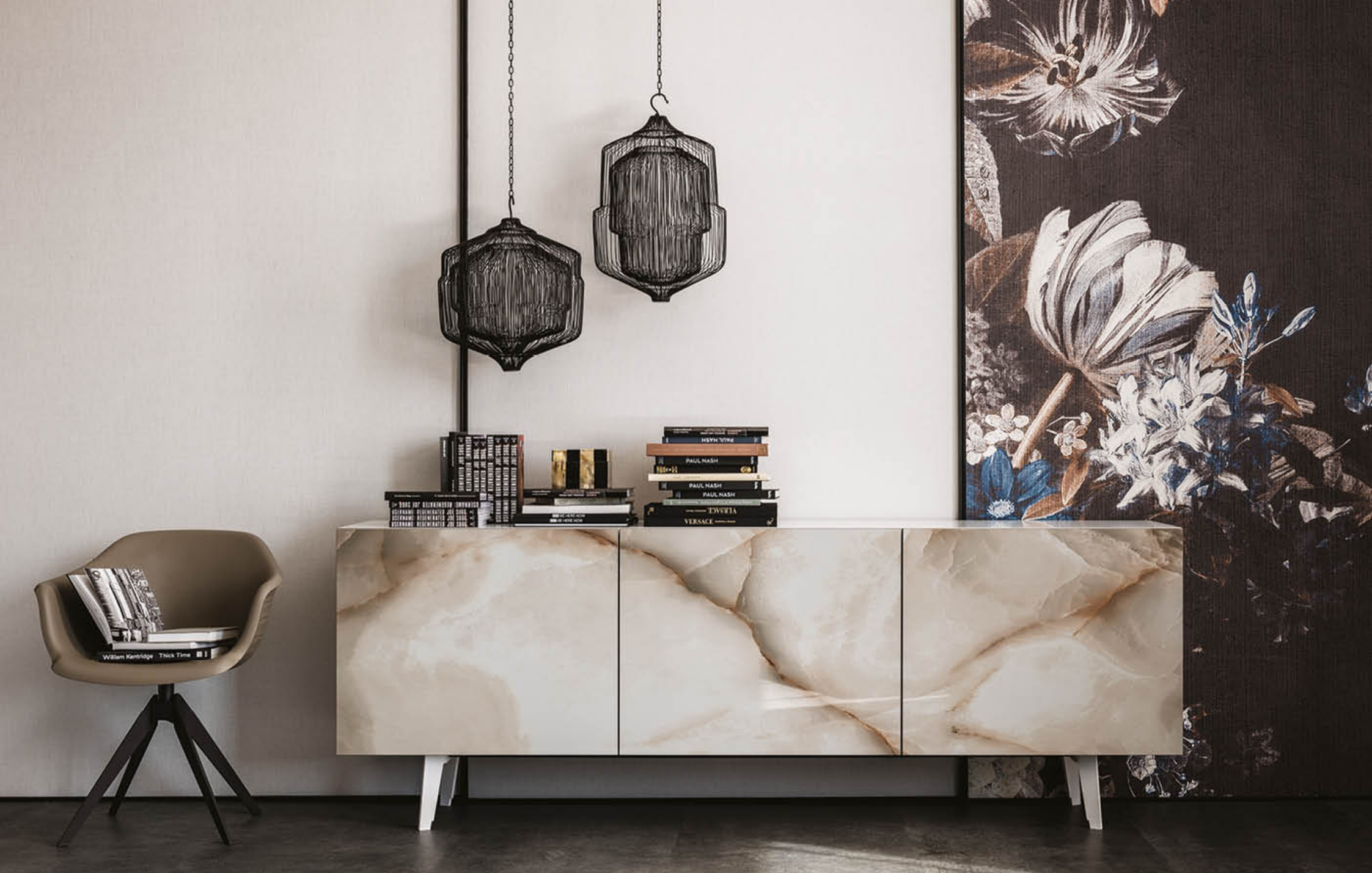
METROPOL alabastro chair INDY