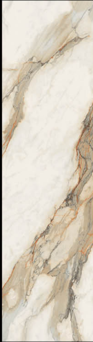
Glossy/Matt Borghini Calacatta