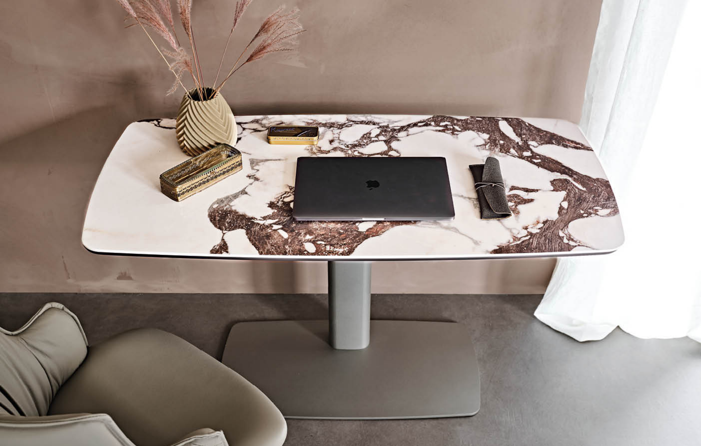
RUNNER KERAMIK breccia chair RIHANNA X