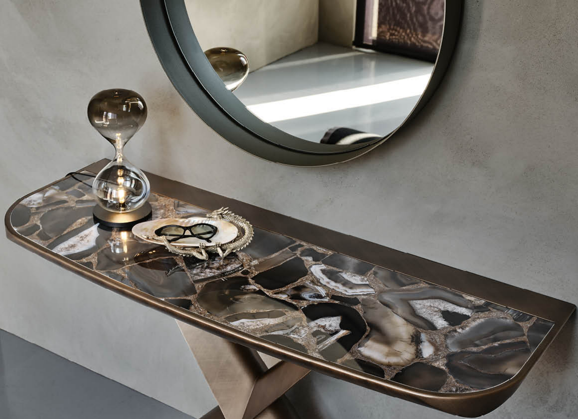
TERMINAL KERAMIK PREMIUM zefiro mirror WISH