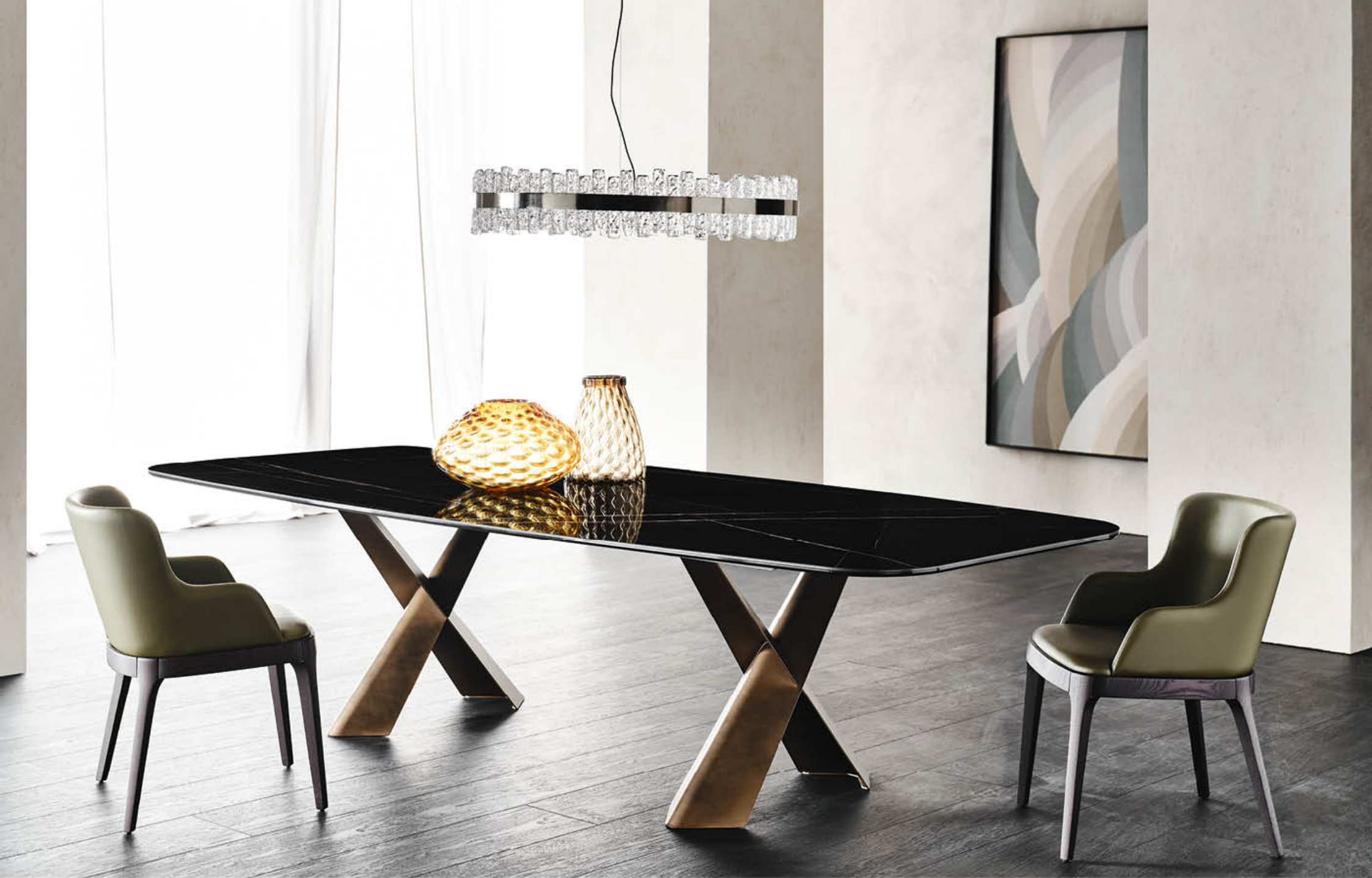
MAD MAX KERAMIK sahara noir chairs MAGDA - lamp PHOENIX