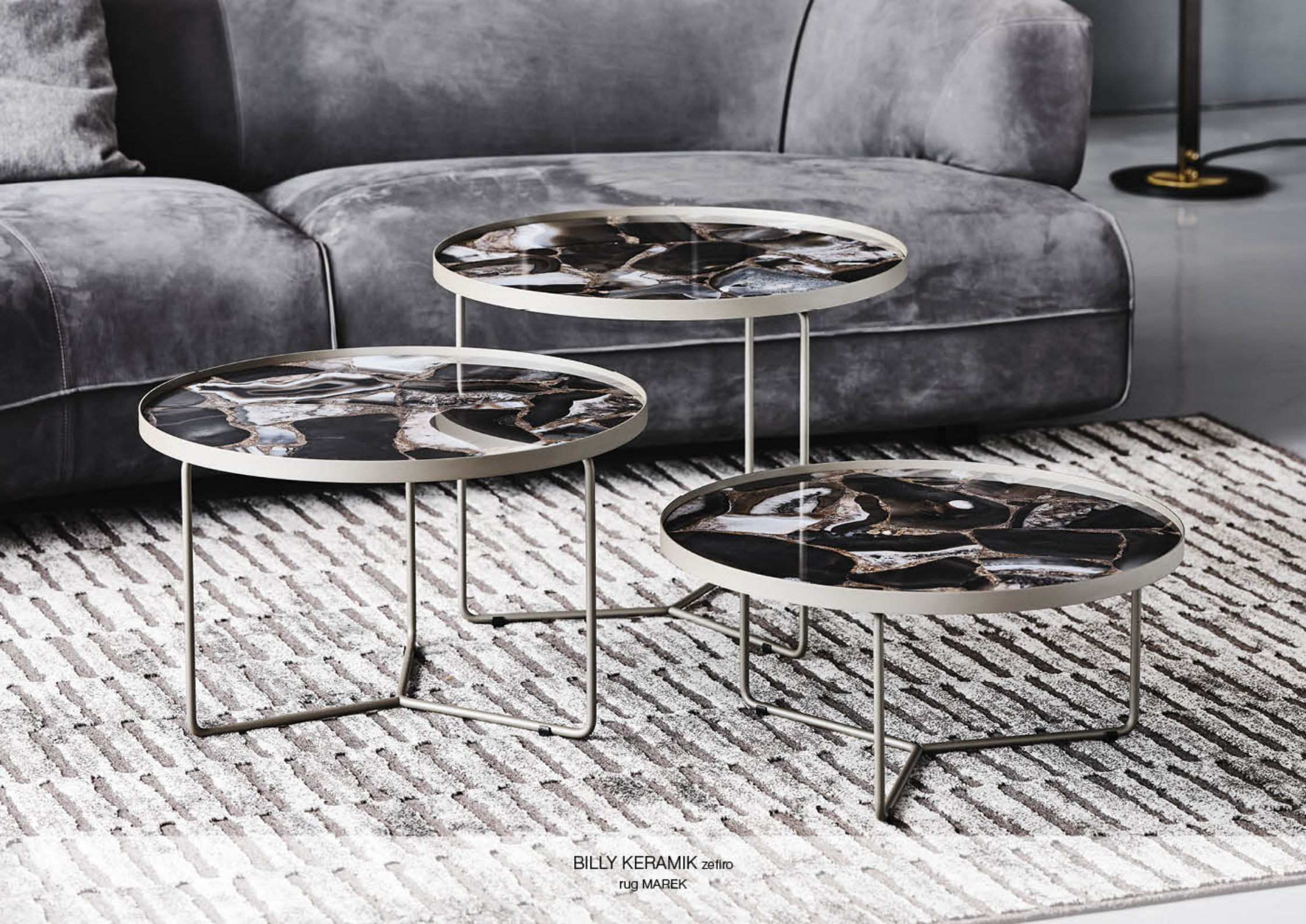
BILLY KERAMIK zefiro rug MAREK