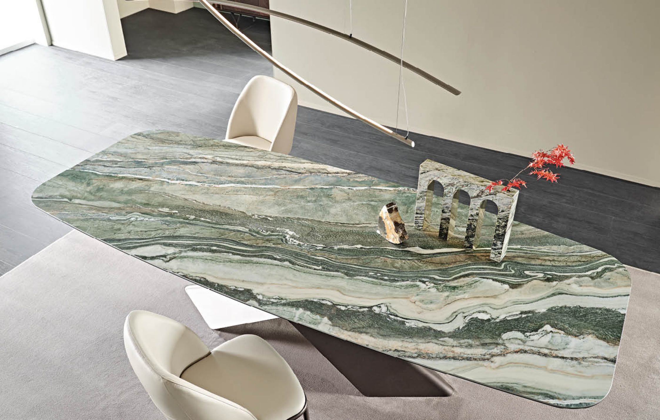
TYRON KERAMIK kaidy chairs MARIEL ML - lamp KATANA - rug KIMI