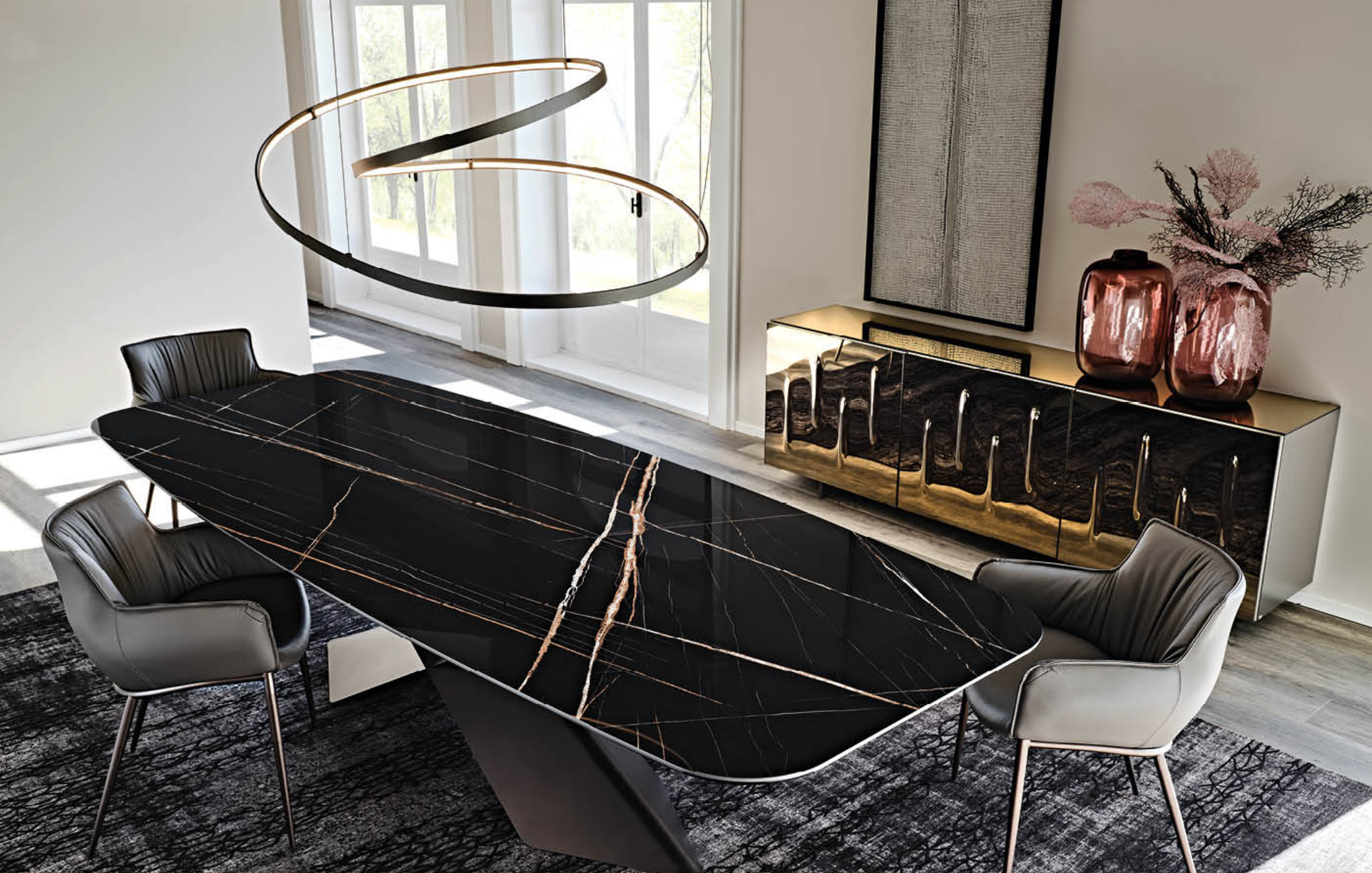
TYRON KERAMIK sahara noir chairs RHONDA - lamp HEAVEN - sideboard CARNABY - rug MUMBAI