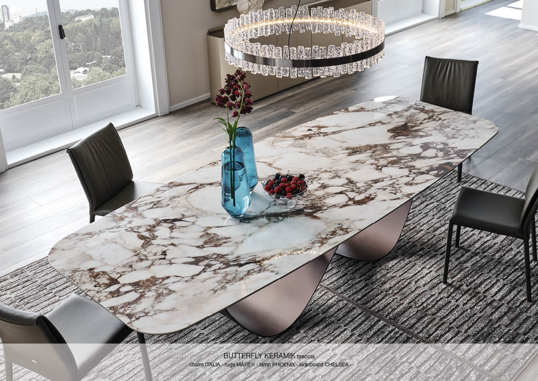
BUTTERFLY KERAMIK breccia chairs ITALIA - rugs MAREK - lamp PHOENIX - sideboard CHELSEA