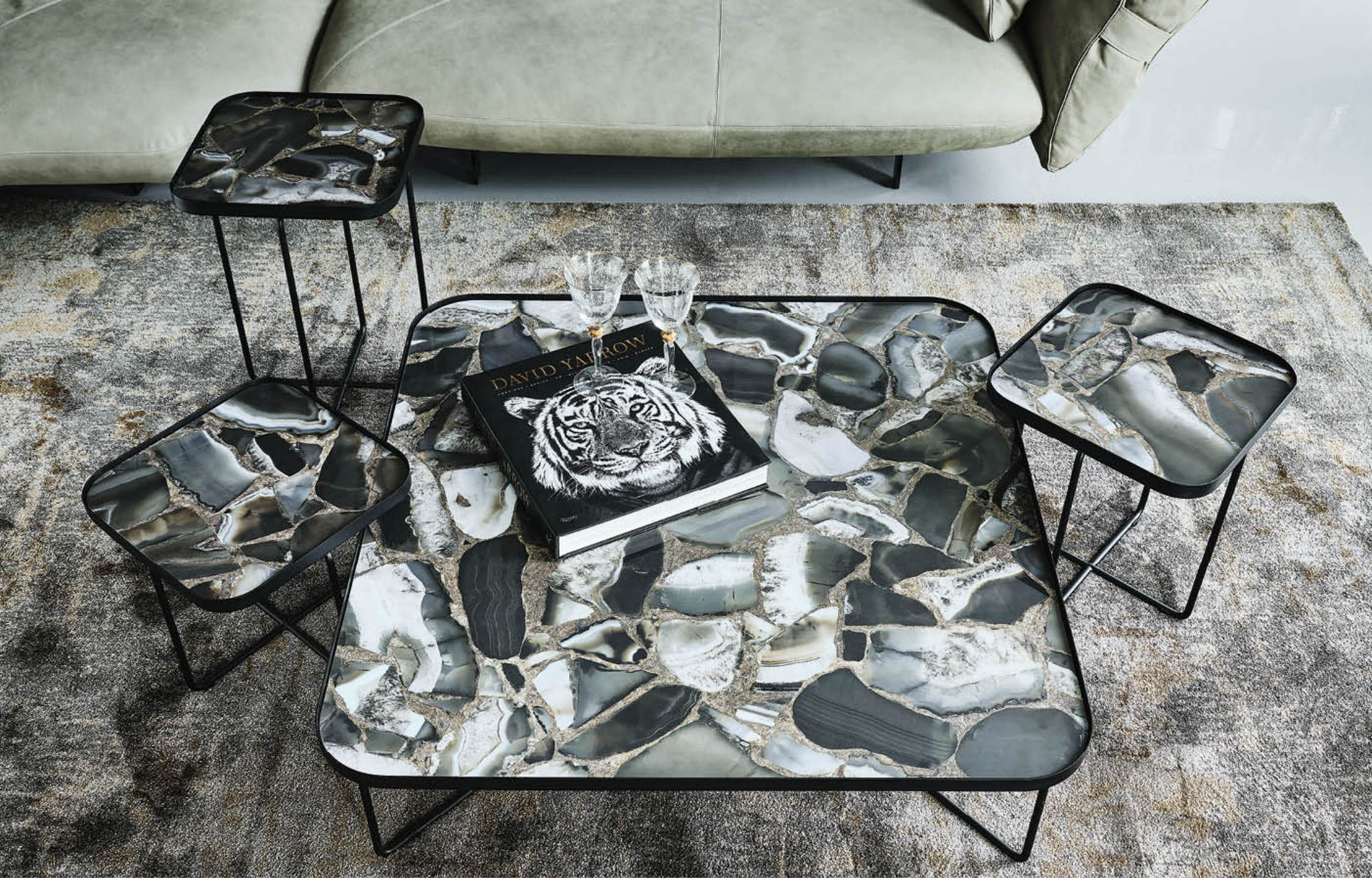
BENNY KERAMIK zefiro