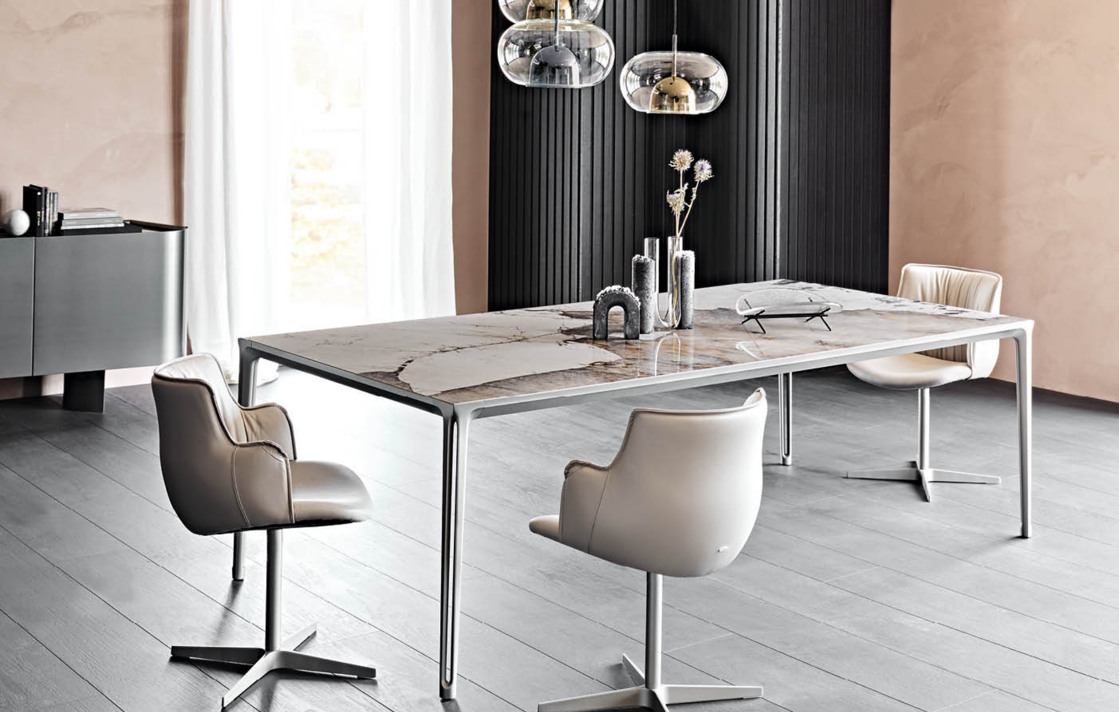
BOULEVARD KERAMIK corcovado chairs RIHANNA X