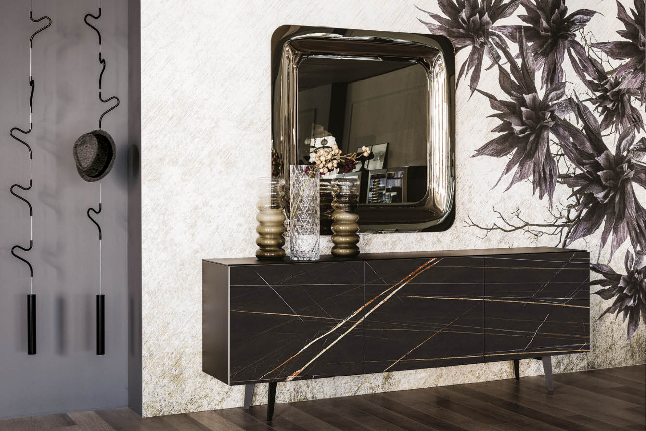
METROPOL sahara noir mirror GLENN - clothes hanger AIR