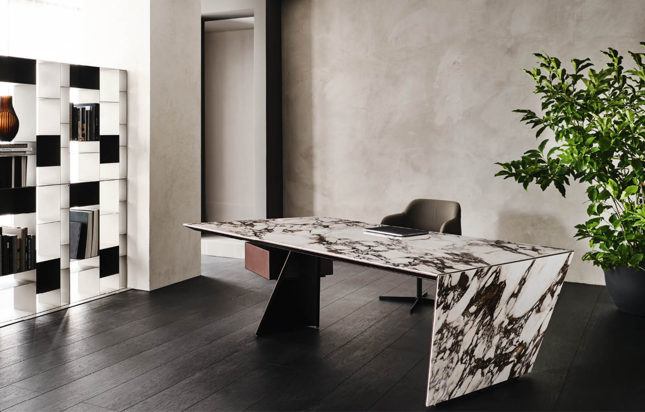
NASDAQ KERAMIK breccia chair BOMBÉ X - bookcases LATITUDE