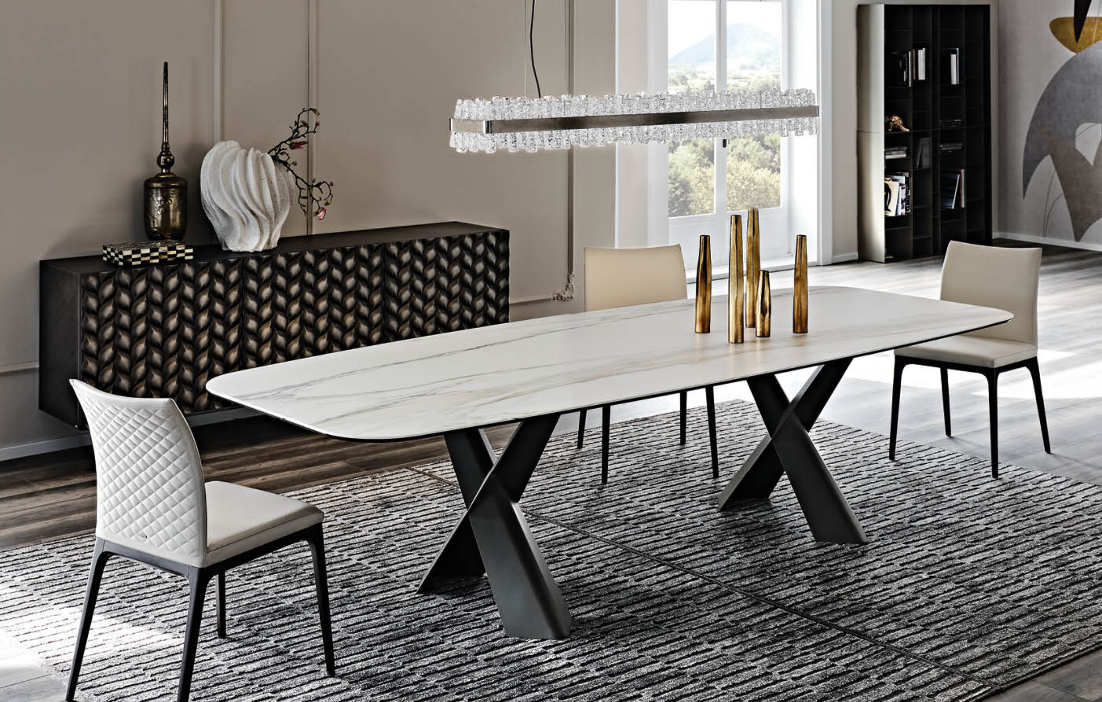
MAD MAX KERAMIK - matt golden calacatta chairs ARCADIA COUTURE - lamp PHOENIX - rugs MAREK - sideboard LAVANDER