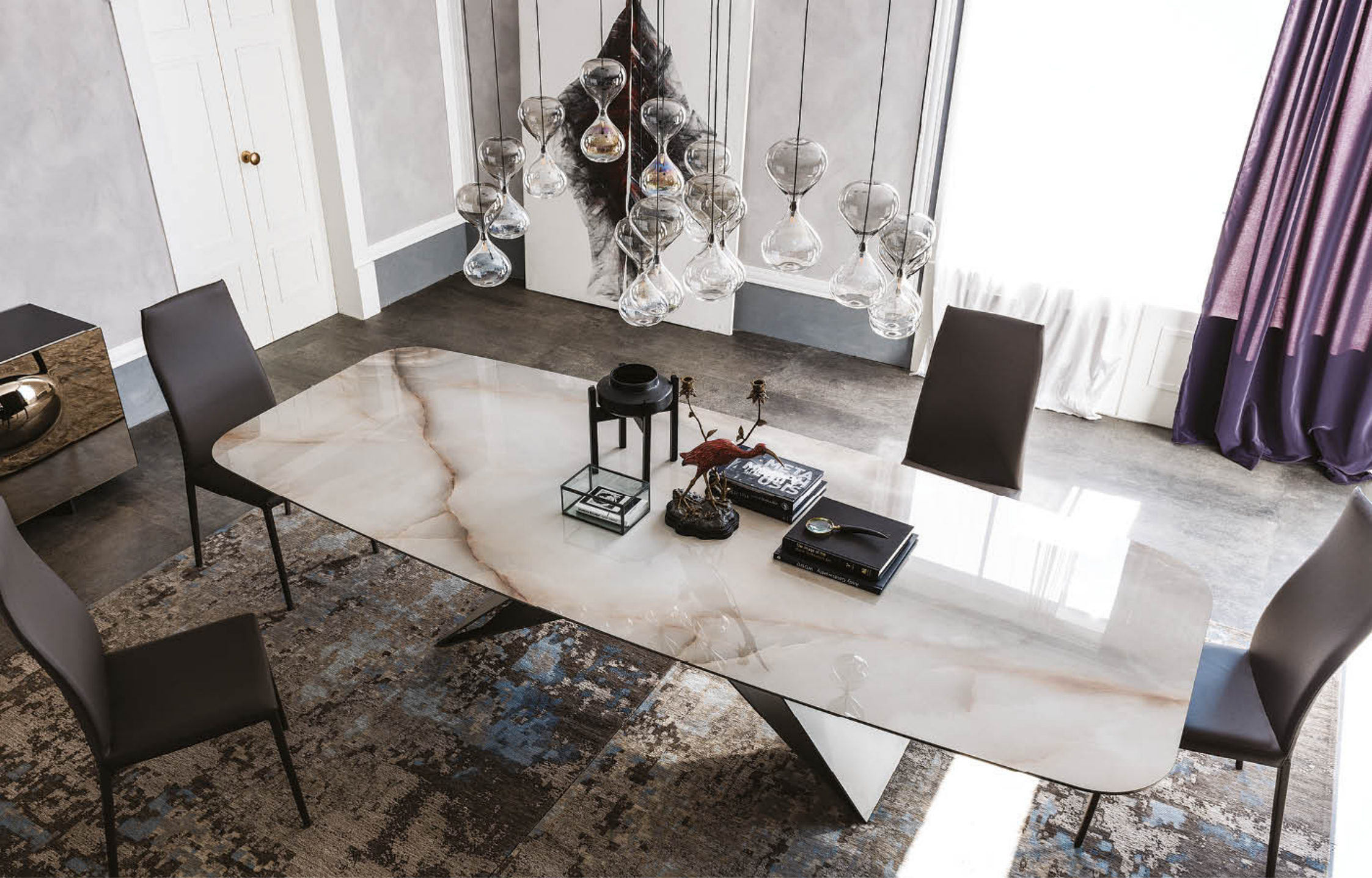
PREMIER KERAMIK alabastro chairs NORMA COUTURE - lamp SABLIER- rugs RADJA