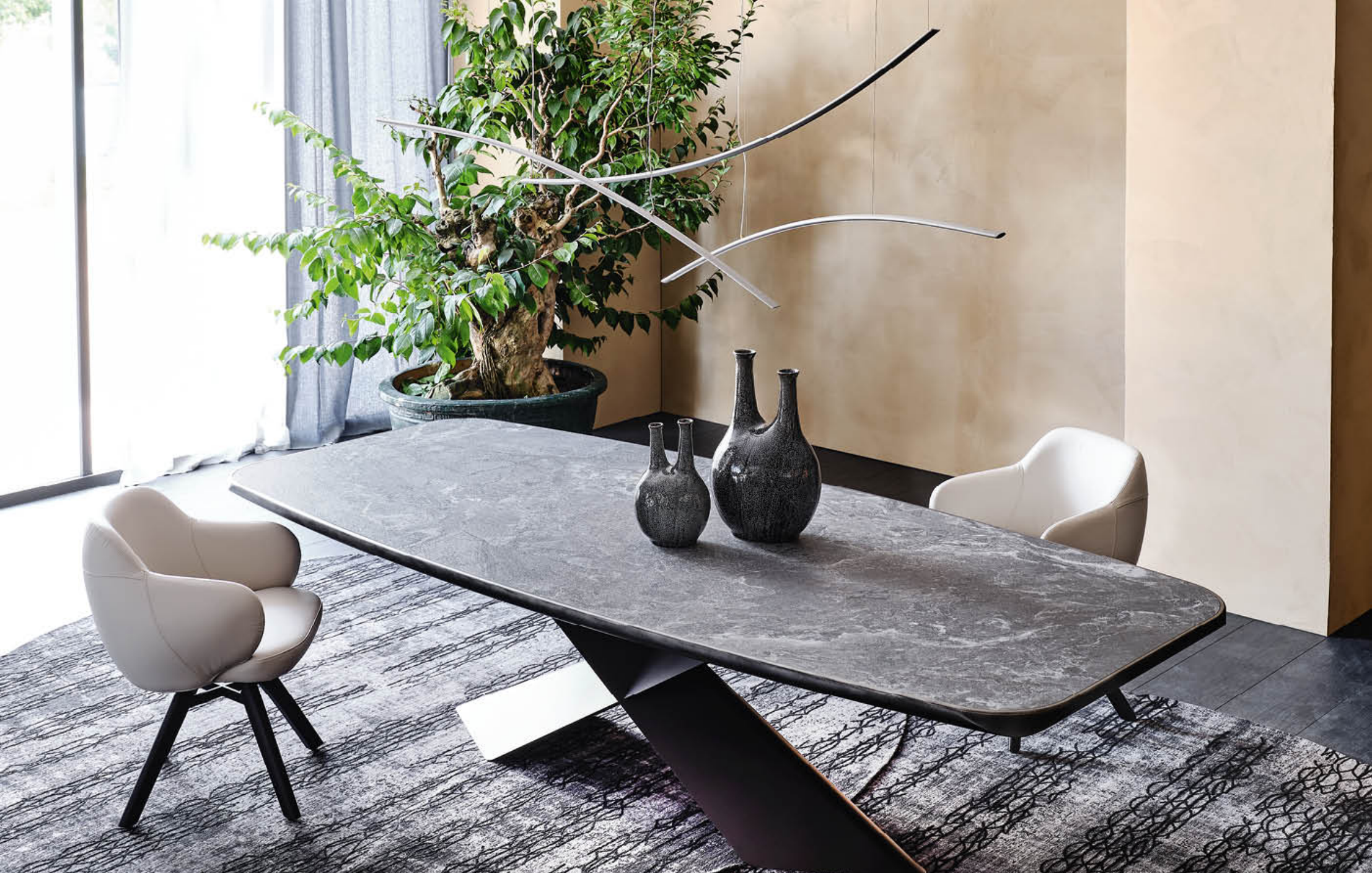
TYRON KERAMIK PREMIUM arenal chairs BOMBE - lamp KATANA - rugs MUMBAI