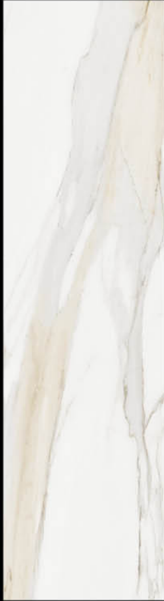
Glossy/Matt Golden Calacatta