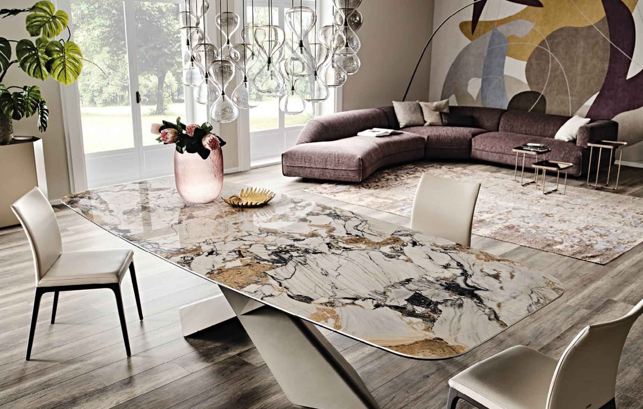
TYRON KERAMIK makalu chairs ARCADIA - lamp SABLIER - rug RADJA - coffee table BENNY