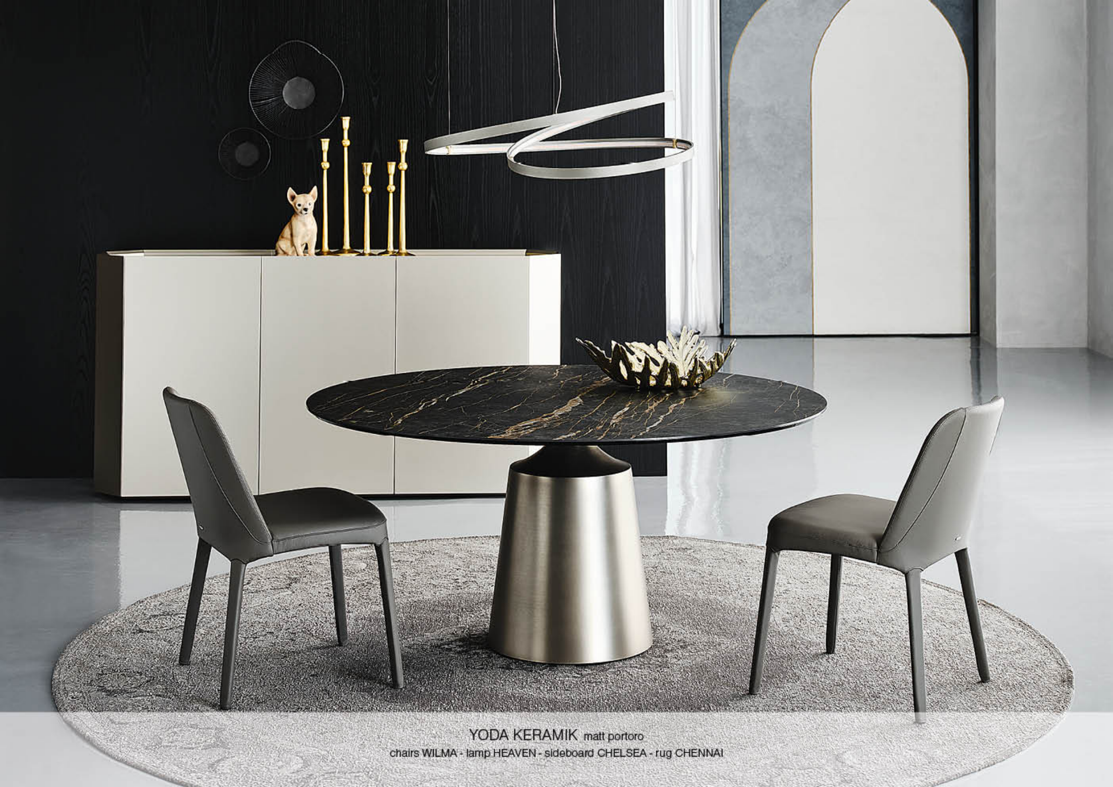
YODA KERAMIK matt portoro chairs WILMA - lamp HEAVEN - sideboard CHELSEA - rug CHENNAI