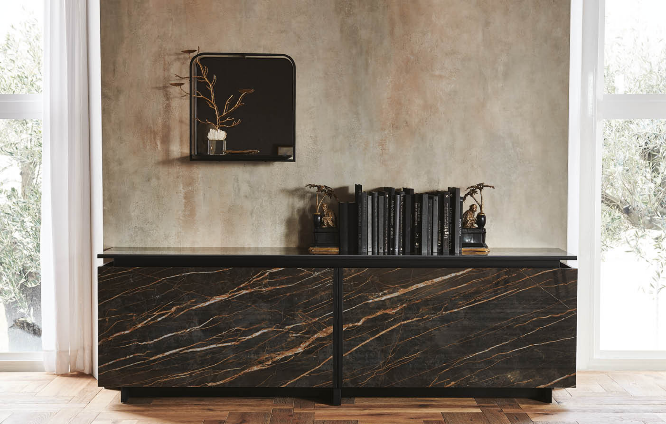
EUROPA KERAMIK glossy portoro shelf TRESOR