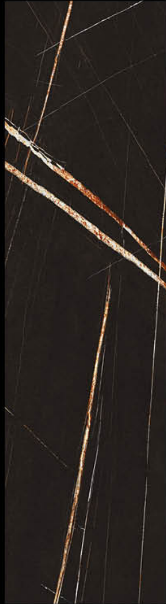
Glossy Sahara Noir