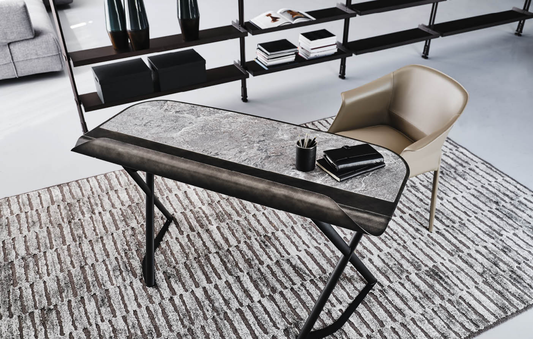
COCOON KERAMIK arenal chair ZULEIKA - bookcase FREEWAY - rug MAREK