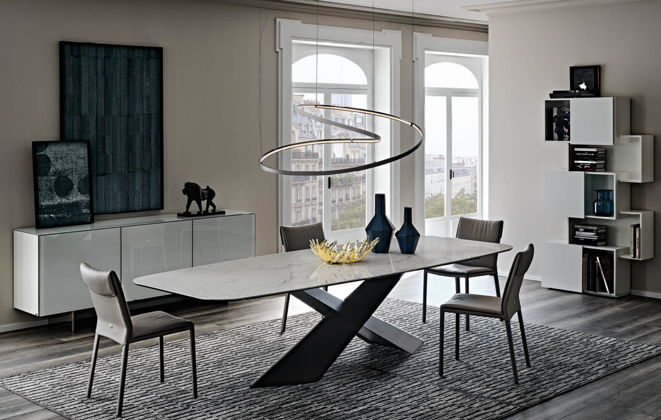
TYRON KERAMIK supreme chairs ISABEL - lamp HEAVEN - sideboard FOCUS - bookcase PIQUANT - rugs MAREK