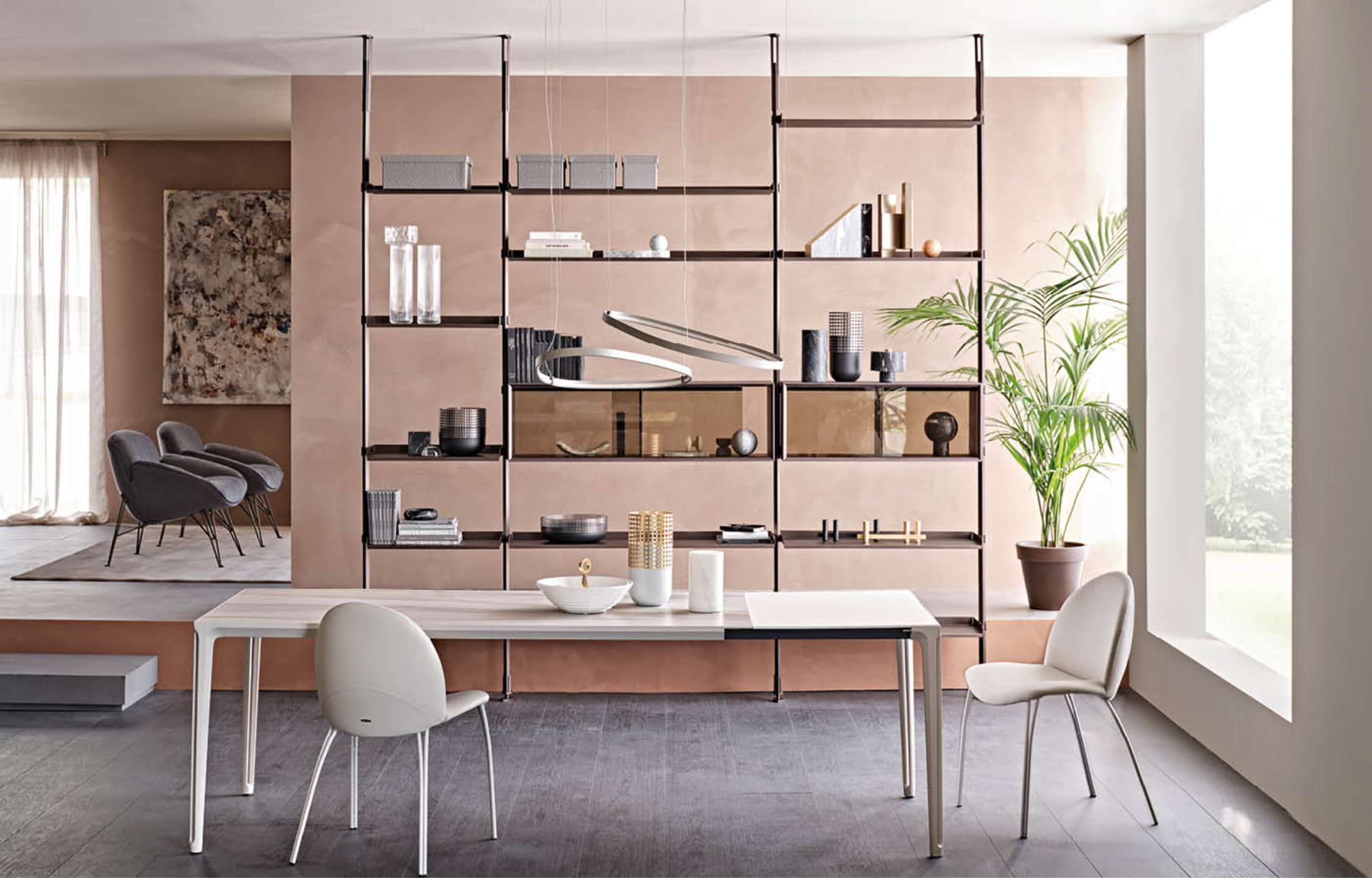
BOULEVARD KERAMIK DRIVE matt golden calacatta chairs KELLY - lamps MAGELLANO - bookcase FREEWAY