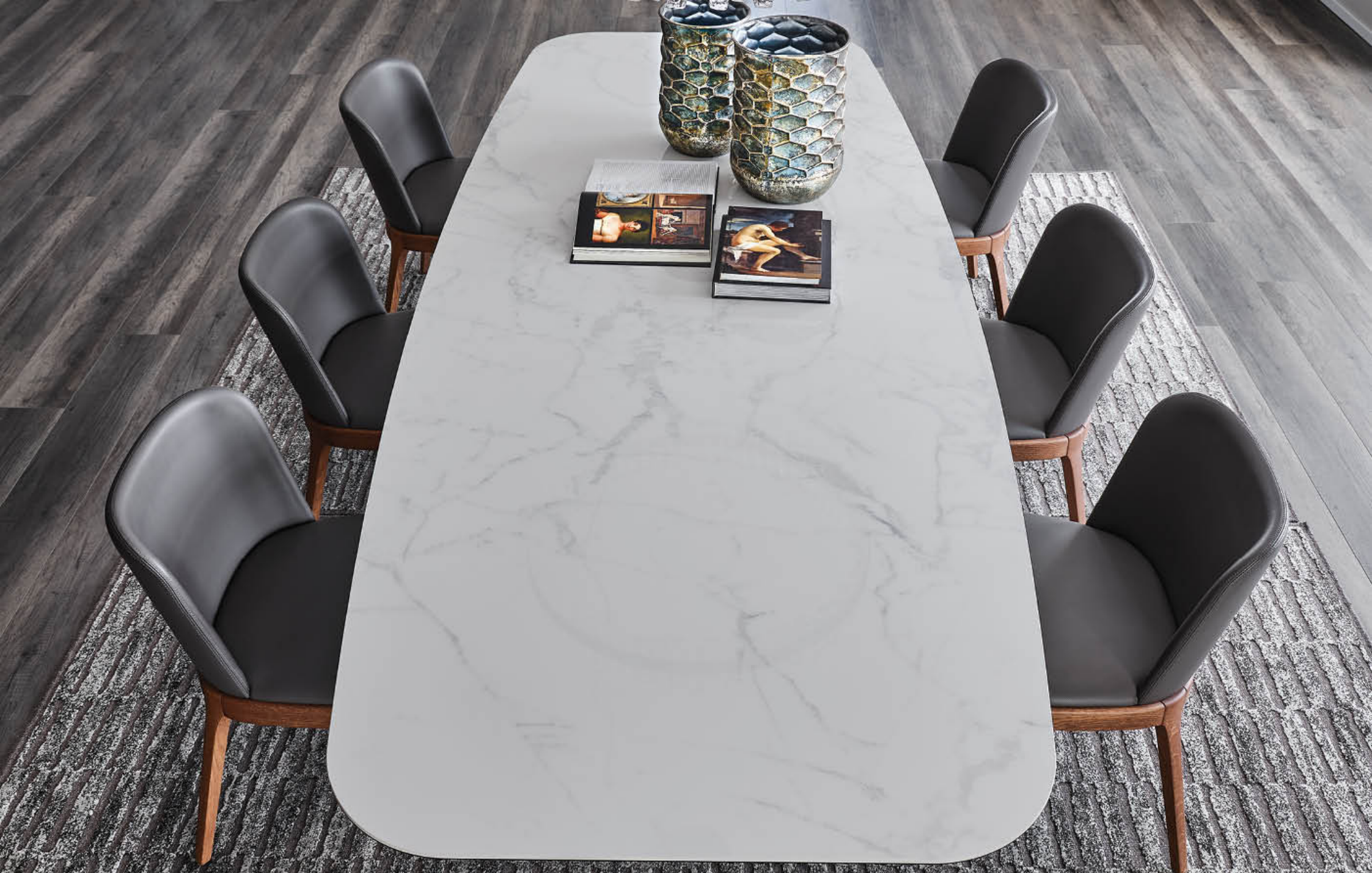
SKORPIO KERAMIK supreme chairs MAGDA - rug MAREK