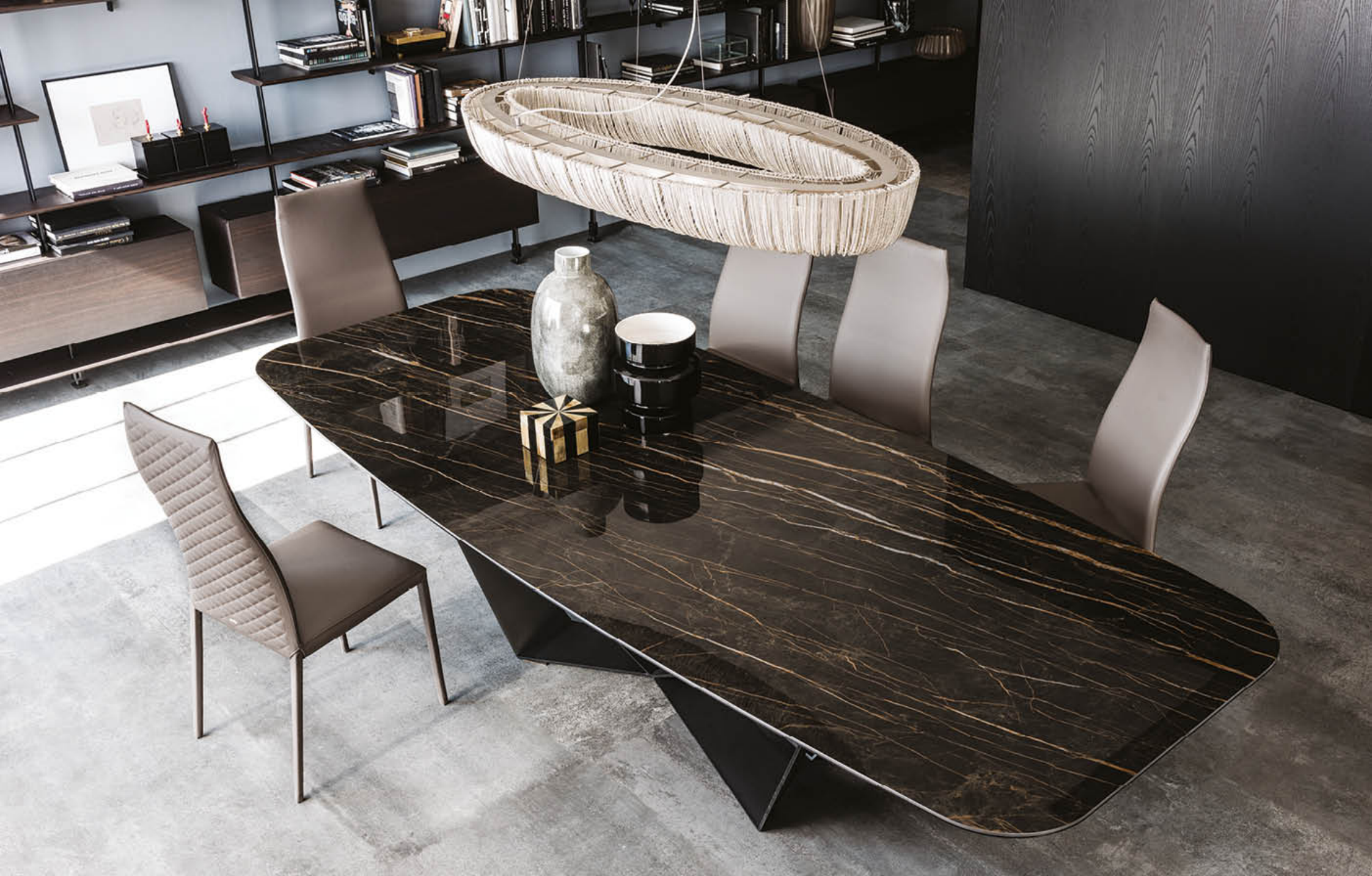
SKORPIO KERAMIK glossy portoro chairs NORMA COUTURE H - lamp CELLINI - bookcase AIRPORT