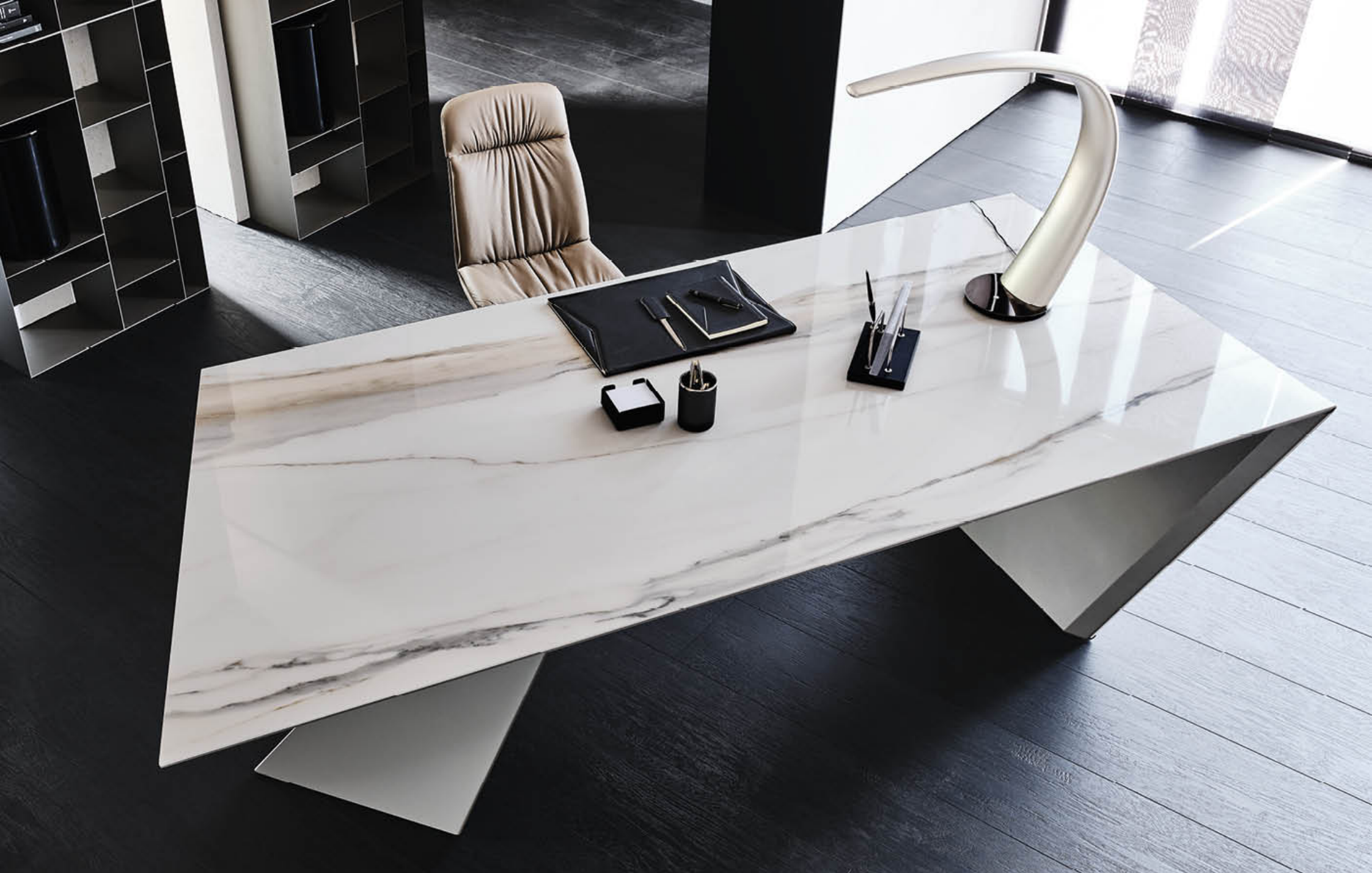
NASDAQ KERAMIK glossy golden calacatta chair KELLY - table lamp MAMBA - bookcases LATITUDE