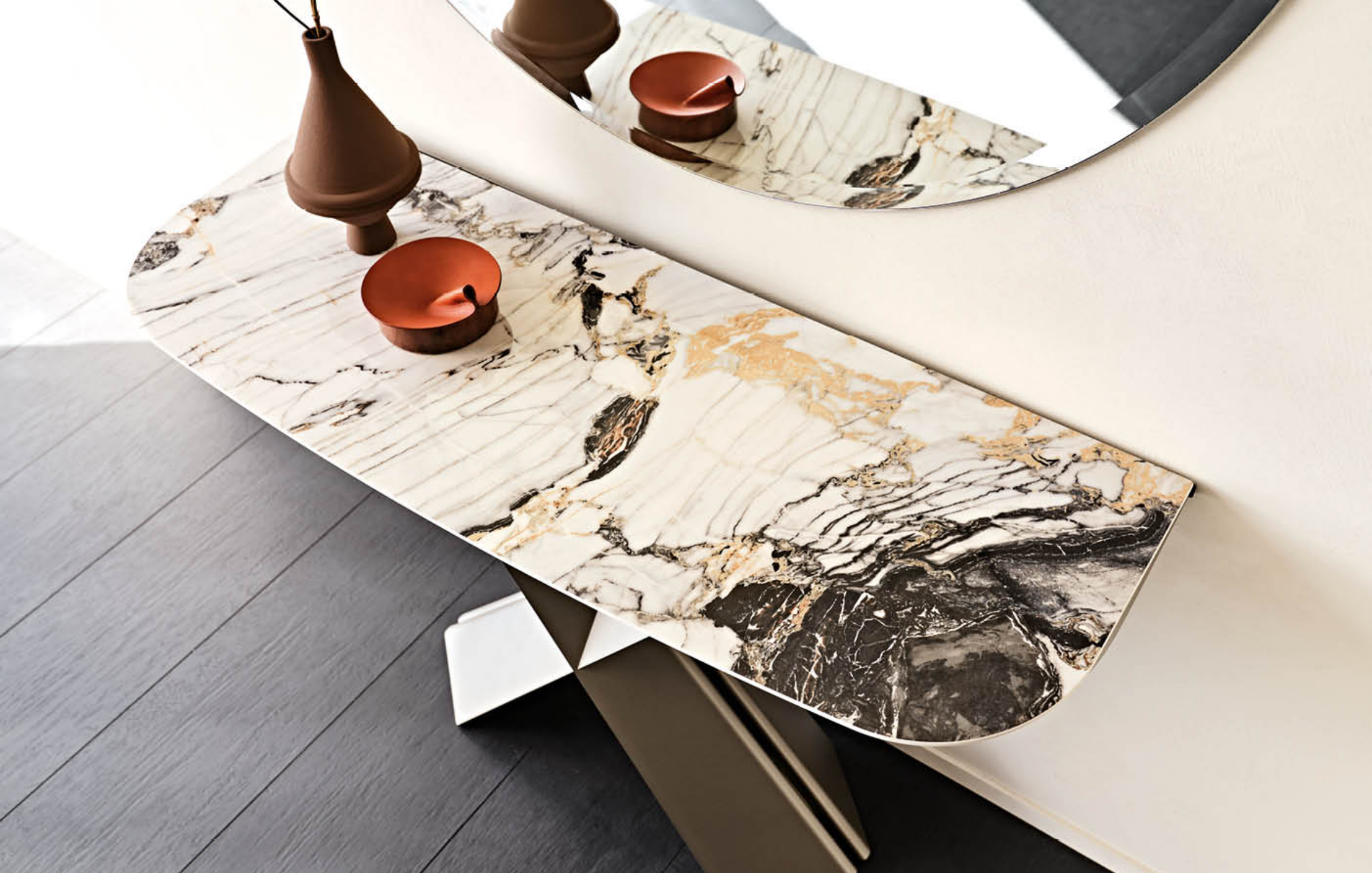
TERMINAL KERAMIK DRIVE makalu mirror HAWAII ROUND