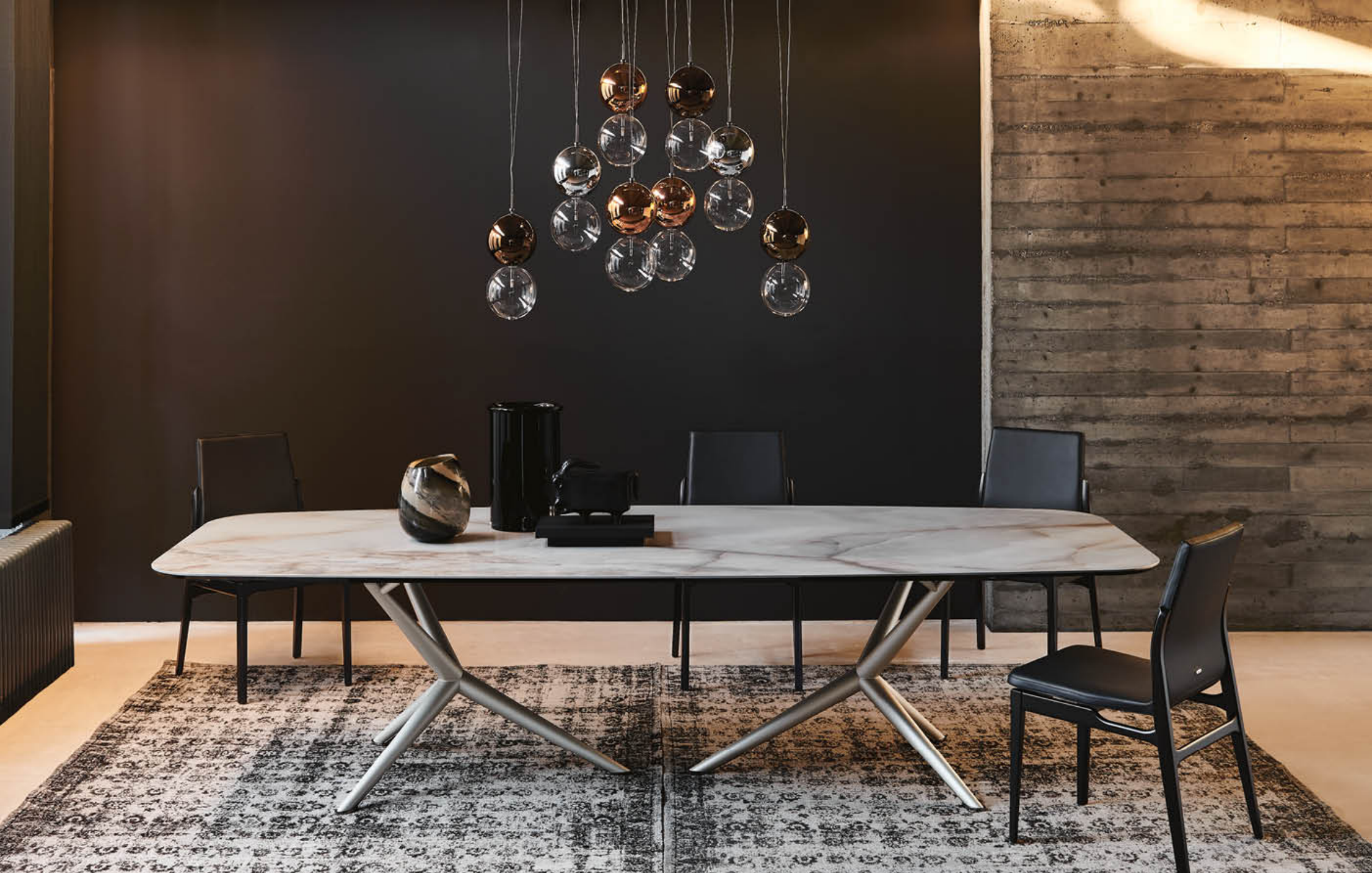
ATLANTIS KERAMIK alabastro chairs GINEVRA - lamp APOLLO - rugs MAPOON