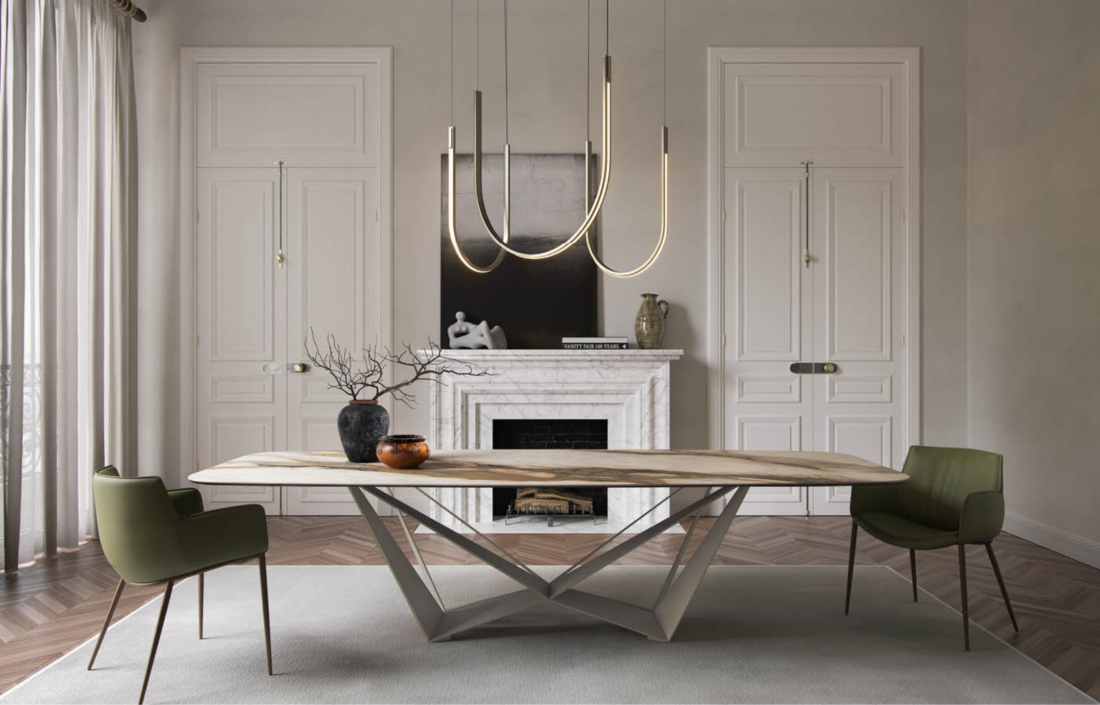
SKORPIO KERAMIK borghini calacatta chairs RHONDA - lamps NAHUN - rug KIMI