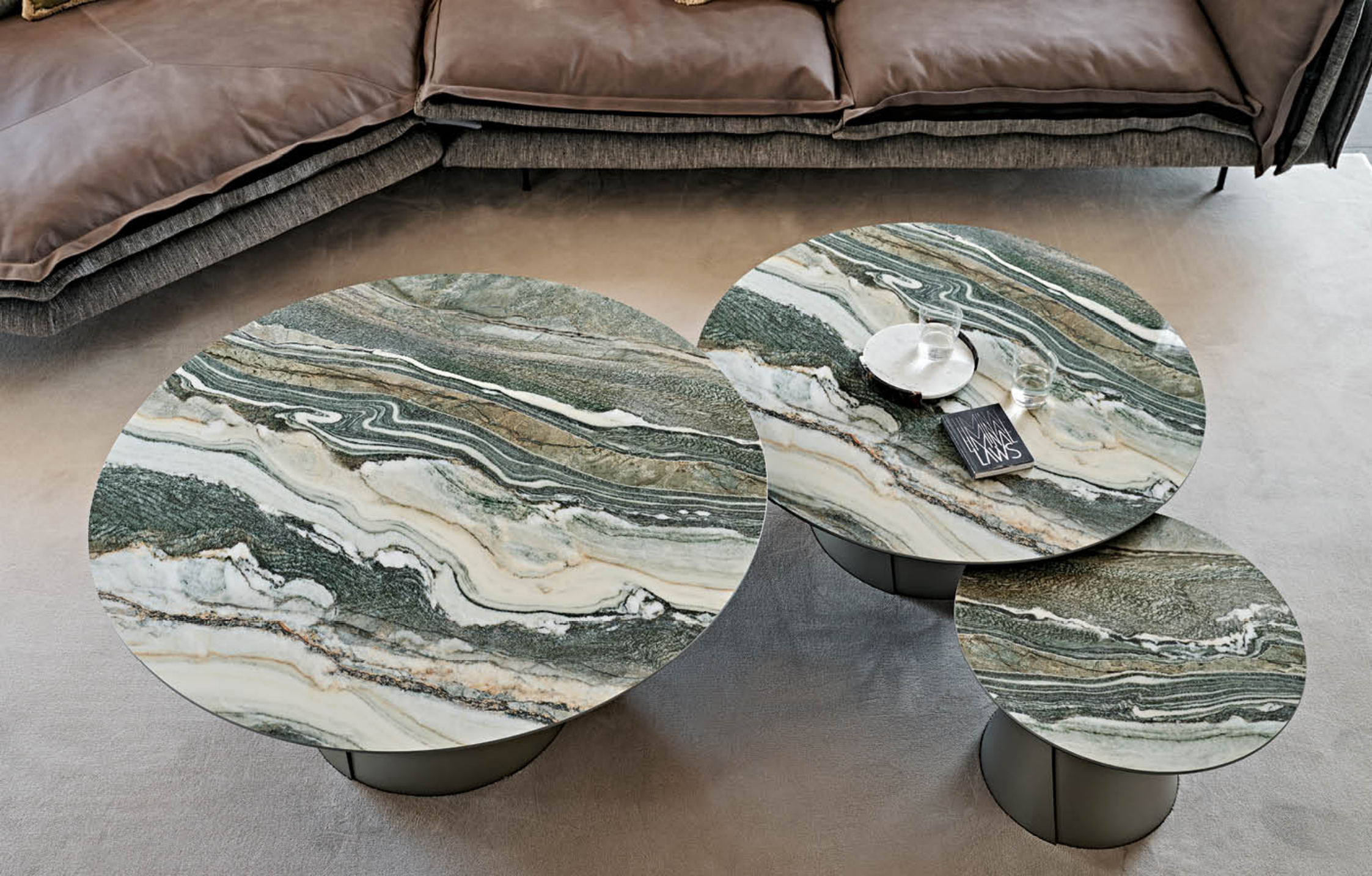
ALBERT KERAMIK kалды rug KIMI